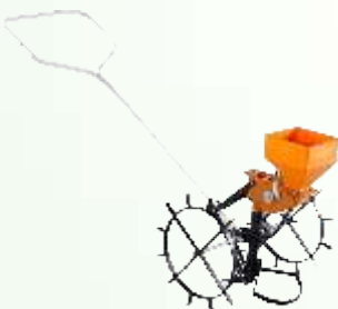
Manual Seed Drill