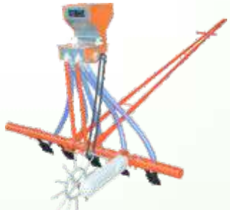
Animal Drawn Seed Drill