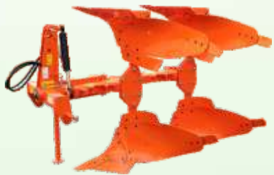
Manual / Reversible MB Plough

Mfd. & Mktd.: E/16, Industrial Estate, C.B. Ganj, Bareilly (U.P.) - 243122